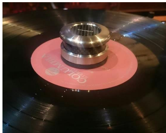
LP side surface ( \alpha Piezo Ceramic sheet) Machined from nonmagnetic stainless (two layers)